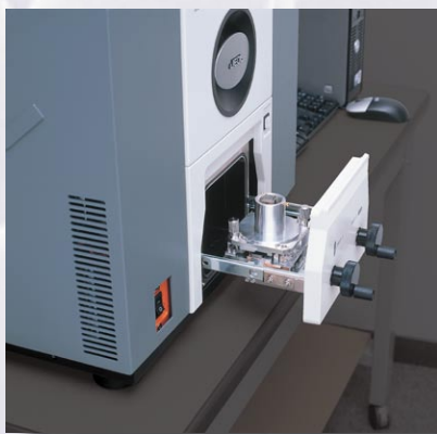
Specimen stage simplifies sample loading

For a wide range of samples from biological to materials, NeoScope has high vacuum and low vacuum modes, secondary electron and backscattered electron imaging, and three selectable accelerating voltages of 5, 10, and 15kV. The specimen stage accommodates samples up to 50mm thick. It's simple to obtain clear, crisp images of defects, foreign materials, surface blemishes, textiles, invertebrates, biological tissues, forensic evidence, or examine the compound eye of a fly. No special preparation of samples, i.e. coating or drying, is required.