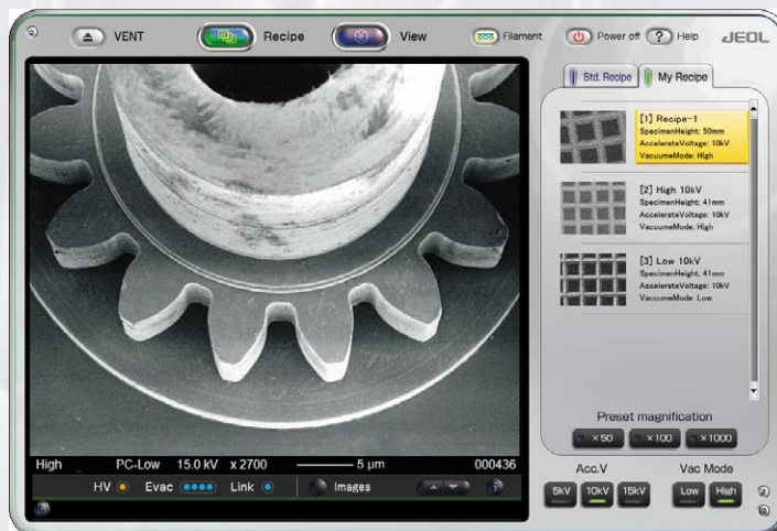
Pre-stored parameter files (recipes) for typical samples