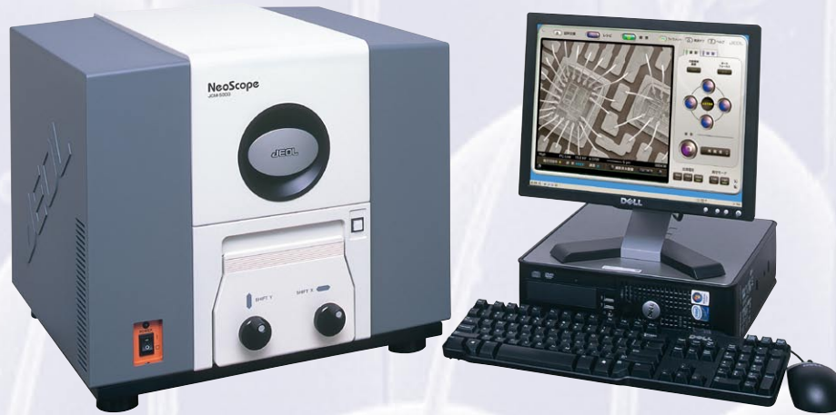
The new benchtop scanning electron microscope