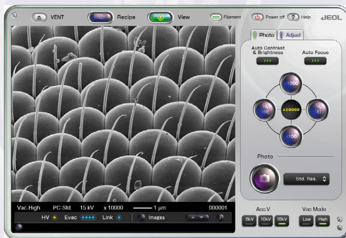
Simple setup for observation and auto imaging - point and shoot!